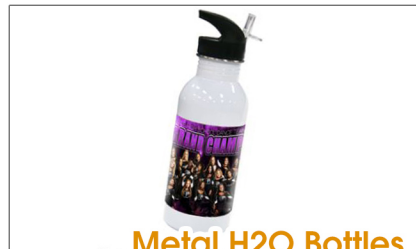
Metal H2O Bottles